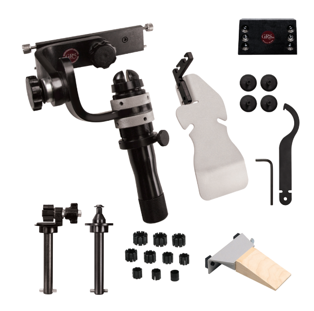
26-4102 Encore Ocx: Stone Setter's Package, $459