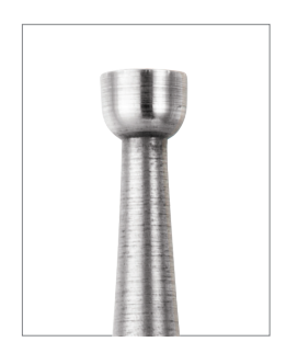
18-4009 Busch Concave Cup Bur, .9mm-3.1mm, $3-$7 Visit Stuller.com for more options.