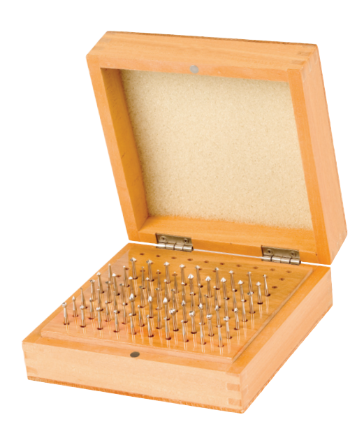
19-3860 Panther Master Bur Kit (82 pieces), $202 Also Available 19-3221 Panther Master Bur Kit (97 pieces), $207

Tired of cutting standard 1¾" length burs to fit? Cut no more. Save time and add precision with short burs.