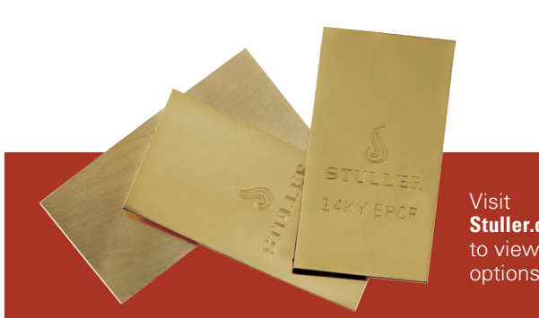
Visit Stuller.com/Solder to view more options.