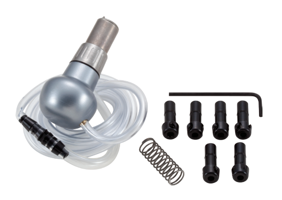
26-4036 GRS® Quick-Change Handpiece #901, $300