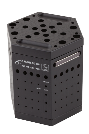
19-9276 Bur Caddy, $41