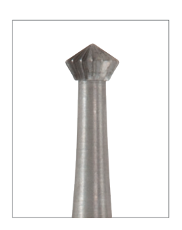
77-1006S Panther Short 90° Hart Burs, .9mm-1.6mm, $12 Visit Stuller.com for more options.