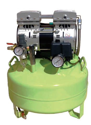
14-4990 Ultra Quiet, Oil-Free Air Compressor, 6 gallon, $635