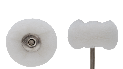
16-7055 Mounted Miniature Brush, Scotch-Brite, 1", $14

16-7051 Mounted Miniature Geza Brush, Gray Chungking Bristles, 7/8", $13