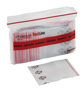
90-0000 Minigrip® RedLine ^{\text{\tiny M}} Bag with Resin ID symbol, $3-$12 Search 11-62440 on Stuller.com to view more options.