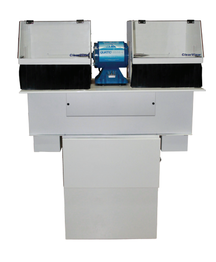
47-4221 Quatro Stand-Up Polishing Unit, ½ HP, $2,750