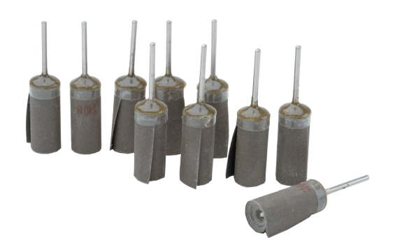
10-6090 Abrasive Rolls with Mandrel, 240 Grit, $7