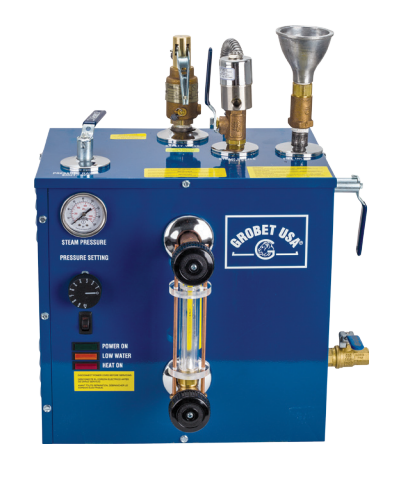
15-0510 Grobet Steam Cleaner, $1,395

Remove all buffing and polishing compounds easily with Ultra CR.