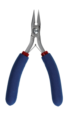
46-0011 Chain Nose, Standard Handle Plier - Short Smooth Jaw, $44