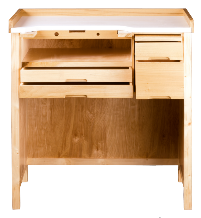
13-0436 Jeweler's Bench With Surell® Surface, $850