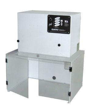
45-6010 Rhodium Containment Extractor (RH), $1,249