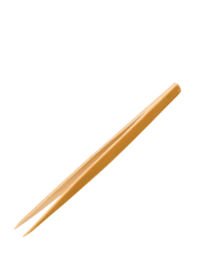
57-7517 Small Pointed Bamboo Tweezers, 6", $5