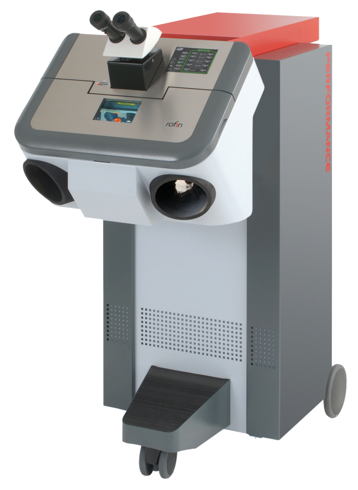
14-0110 Rofin® Starweld Performance 7002 Laser Welder, $27,500