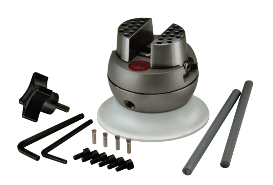
26-4167 Microblock Ball Vise, $268