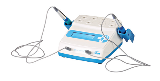
22-0085 Kerr® Ultra-Waxer 2, $375