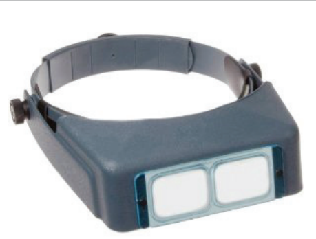
29-4708 Optivisor® Da5, Power 2.5×, Working Distance 8", $40

29-4763 Diamond Setting Glasses - Regular, Extra-Short, 2×, $240 29-4763 Diamond Setting Glasses - Regular, Extra-Short, 2.5×, $250 29-4763 Diamond Setting Glasses - Regular, Short, 3.5×, $295