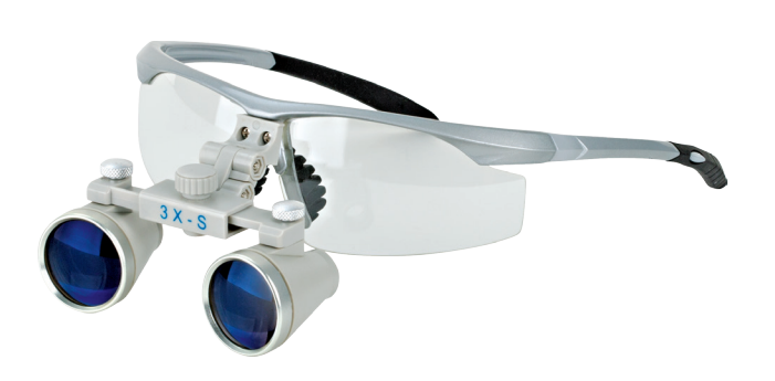
29-4763 Diamond Setting Glasses - Regular, Short, 3x, $290

29-4763 Diamond Setting Glasses - Regular, Extra-Short, 2×, $240 29-4763 Diamond Setting Glasses - Regular, Extra-Short, 2.5×, $250 29-4763 Diamond Setting Glasses - Regular, Short, 3.5×, $295