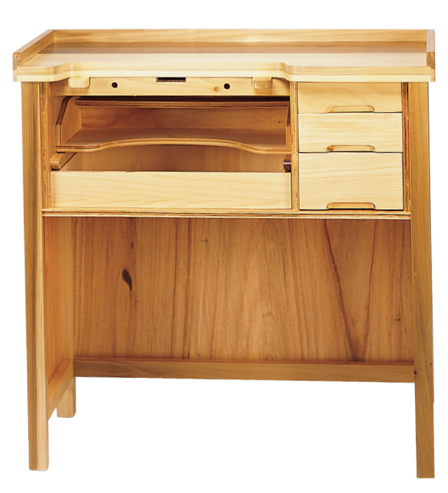
13-0430 Jeweler's Workbench, $555