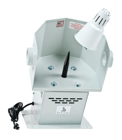
47-7000 Split Lap Machine, 1/2 HP, $379