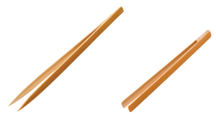
57-7518 Large Pointed Bamboo Tweezers, 91/8", $5