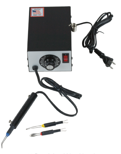
47-4160 Precision Wax Heating Tool 110V/160Hz/1Ph, $145