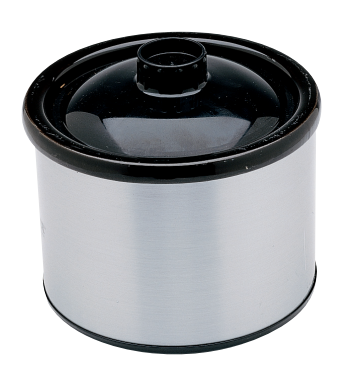
45-3015 Little Dipper Pickle Pot, $25