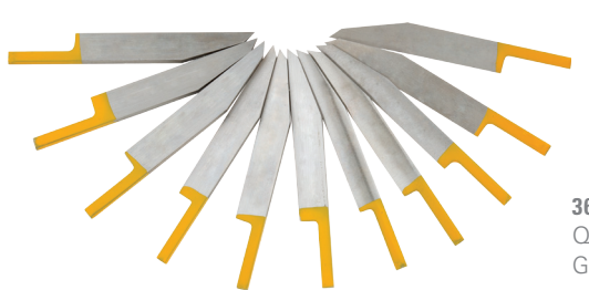
36-2715 HSS Swiss Graver, 1mm, $11

Pre-shaped, quick-change gravers are designed to fit the GRS® Quick-Change Tool Holder for use with the GRS® Quick Change Handpieces. They also work with the Foredom® PowerGraver and the MagnaGravers. Made from special, high-speed steel for long-lasting performance. Genuine, Swiss-made with the yellow tang.