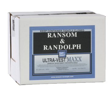
22-4776 R&R Ultra-Vest® Maxx, 50lb carton, $59