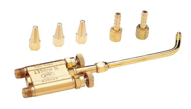
14-1600 Midget Torch With 3 Tips, $245