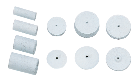
11-6000 Unmounted Silicone Wheel, $1-$2 Search 11-6000 on Stuller.com to view more options.