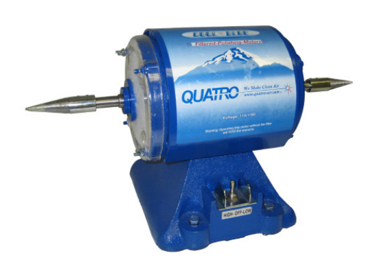
47-3971 Quatro Cool Blue Dual Shaft Motor, 1/2 HP, 2 Speed, $370