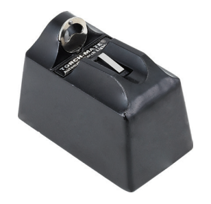
14-2040 Torch-Mate Electronic Torch Lighter, $33