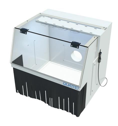
47-4753 Clearview Polish Hood, $289