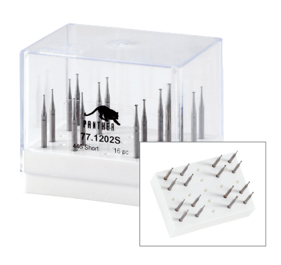
77-1003S Panther Short 70° Hart Thin Bur Set, 16 Piece, $30