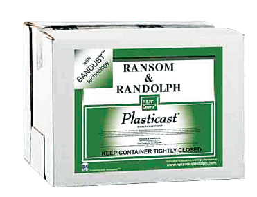
22-4778 R&R Plasticast®, 50lb carton, $52