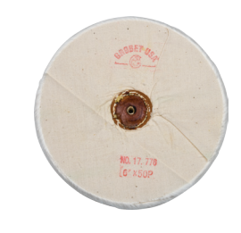
17-7726 Loose Finex Muslin Buff With Leather Center, $8