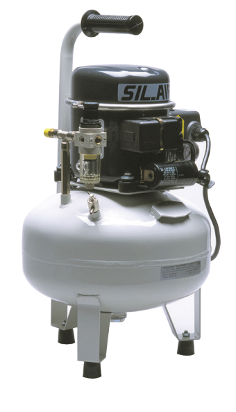
14-5000 Silentaire Compressor, 4 gallon, $1,066