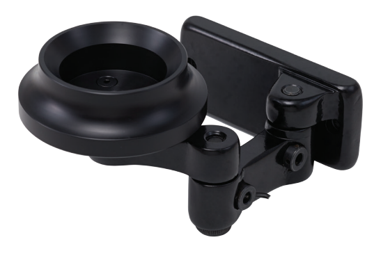
26-4185 Adjustable Swing Arm, $149

Take tension off and legs with the ergonomically