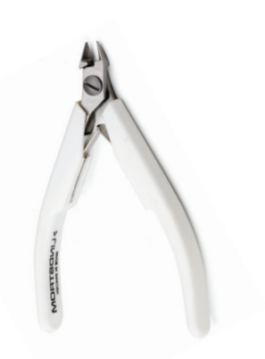
46-7190 Lindstrom<sup>®</sup> Micro Bevel 7190 Plier, $50