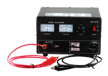
45-4044 Grobet Plating Rectifier, 25 Amp, $356