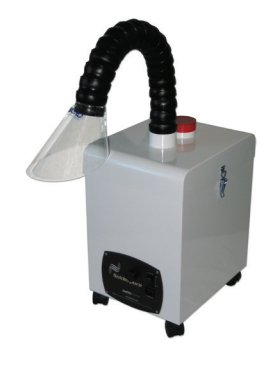
47-4099 Quatro SolderPure™ Rhodium-Plating Fume Collector, $1,295 Also Available 47-4099 Quatro SolderPure<sup>™</sup> Fume Collector, $1,195