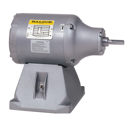
47-4023 Baldor® Polishing Lathe, ½ HP, Single Speed, $415