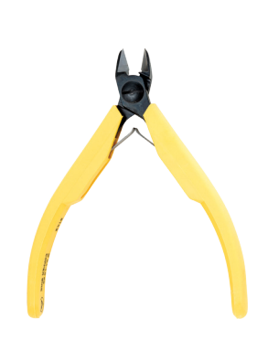
46-8142 Lindstrom<sup>®</sup> Ultra Flush 8142 Side Cutter, $55