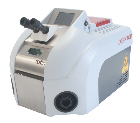
14-0135 Rofin® Starweld Performance Desktop, $17,900

do for your business at Stuller.com/LaserWelders.