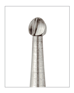
77-1005S Panther Short Round Burs, .5mm-1.6mm, $5-$12 Visit Stuller.com for more options.