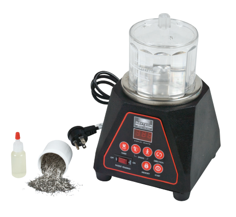
47-5007 Raytech CMF410 Magnetic Finisher, $685