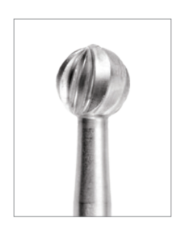
77-1003 Panther Round Burs, .3mm-10mm, $4-$57 Visit Stuller.com for more options.