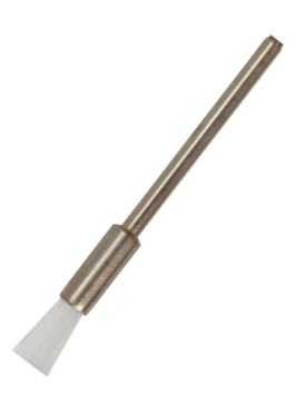
16-7056 Mounted End Brush, White, 4mm, $9

16-7055 Mounted Miniature Brush, Resin-Bonded, Non-Woven Fibers, 1", $15