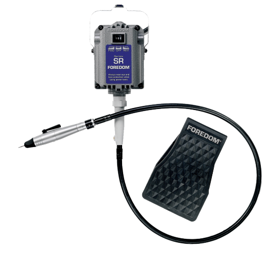
34-2242 SR Foredom® Motor Kit with #20 Quick-Change Handpiece, $245