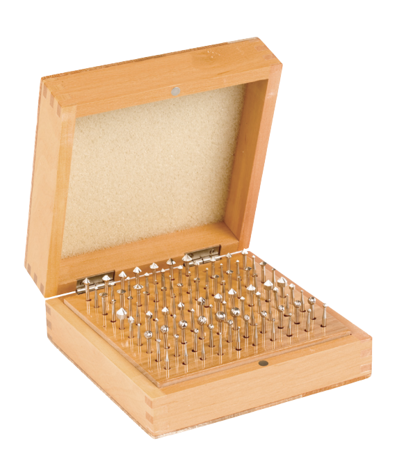
19-3220 Busch Master Bur Set (84 piece), $308