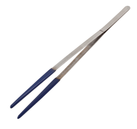
57-9200 Steam Tweezer, 10", $7