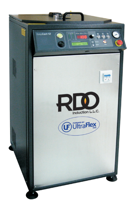
22-2160 Easycast 12, $16,650