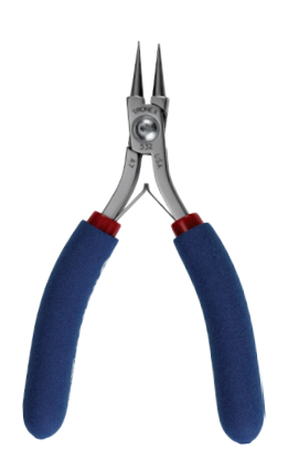
46-0014 Round Nose Standard Handle Plier - Short Jaw, $44