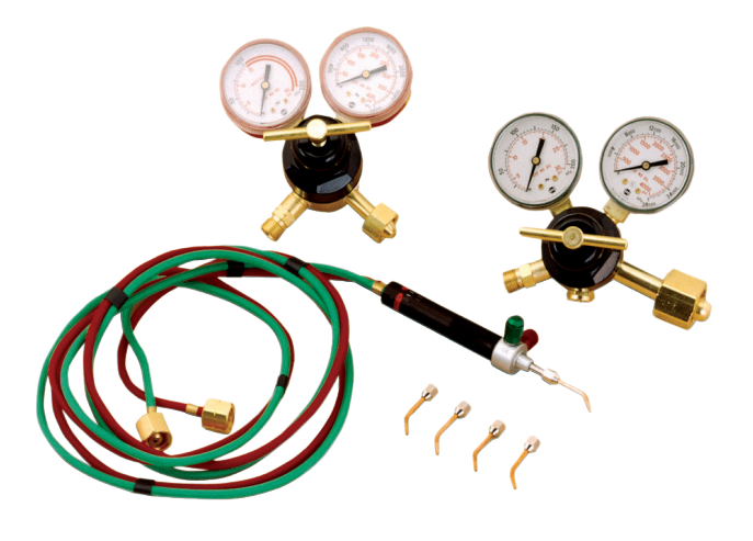
14-0024 The Little Torch® Starter Kit, Propylene And Oxygen, $349