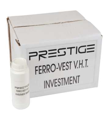
22-4745 Ferro Vest, $150