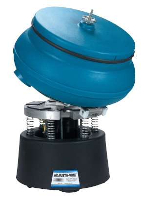
47-5034 Raytech TD40 Vibratory Tumbler, $1,475