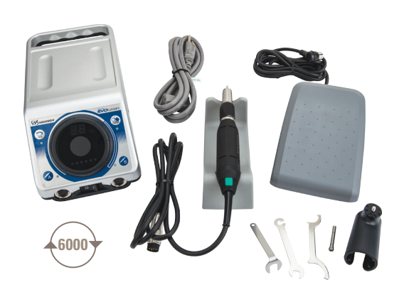
35-1237 NSK Micromotor, $1,350

Low speeds offer extra control and power for stone setting.