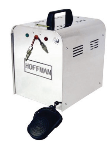
15-0501 Hoffman Gem 3 Steamer, $780