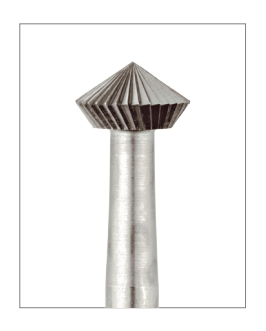
77-1105 Panther 90° Hart Burs, .5mm-5mm, $9-$20 Visit Stuller.com for more options.