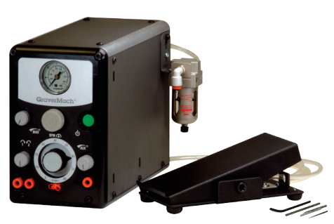
26-4011 GraverMax® G8, $1,295