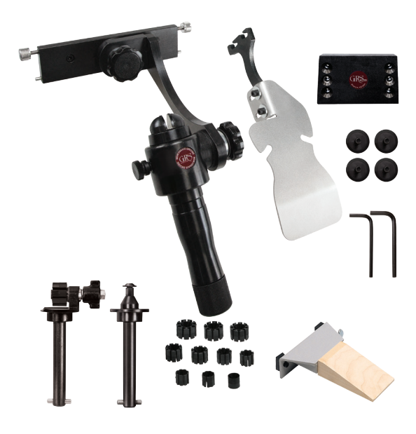
26-4101 Encore Qc: Stone Setter's Package, $419