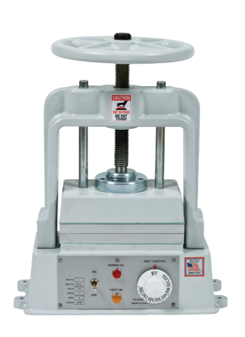
22-7435 Standard Vulcanizer, 2¾" Opening $670 Also Available 22-7436 Deluxe Heavy Vulcanizer, $925