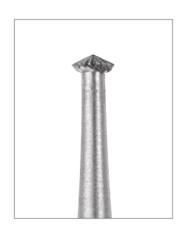
18-4110 Busch 70° Hart Bur, 1mm-5mm, $15-$38 Visit Stuller.com for more options.

Use Pro-Cut™ bur lube to extend the life of your burs.