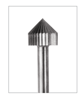
18-4050 Busch Stone Setting Bur, 1mm-8mm, $3-$10 Visit Stuller.com for more options.