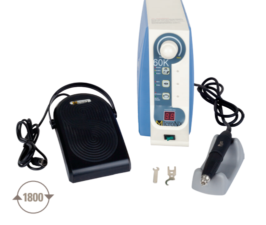
34-6105 Micro-NX BLTK-800C 60K Micromotor Set, $495