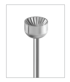
77-2808 Panther Cup Burs, .8mm-5mm, $9-$28 Visit Stuller.com for more options.