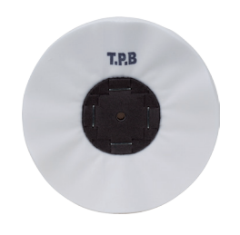
47-3228 Luxor® TPB Medium-Grade Cotton Buff, 4", $16 Also Available 47-3228 Luxor® TPB Medium-Grade Cotton Buff, 6", $36