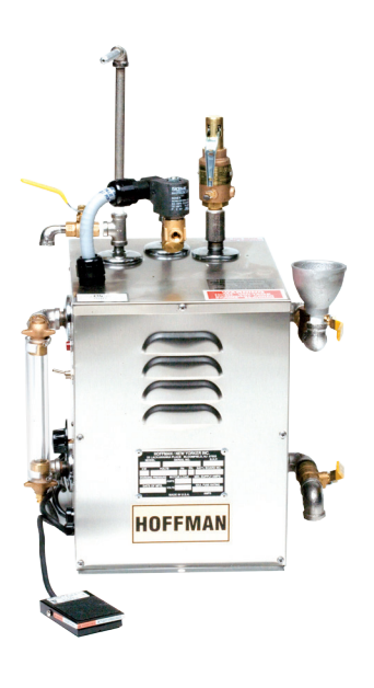
15-0503 Hoffman Jel-3 Steamer, $1,199