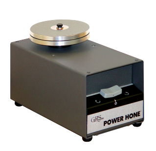
26-4160 GRS<sup>®</sup> Basic Power Hone, $498