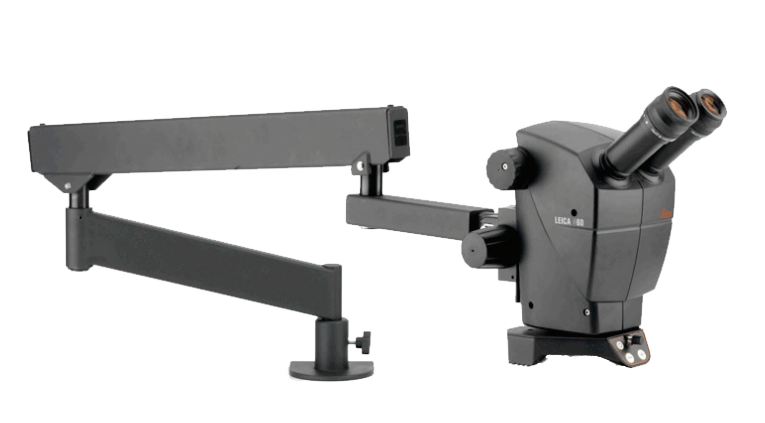
29-4758 Leica® Bench Microscope with Flex Arm Stand, $2,137