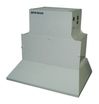
45-3085 Rhodium Ductless Fume Hood, $1,164