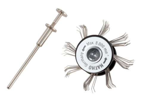
11-7100 Minimat Brush with Mandrel .30mm, $43

16-7056 Mounted End Brush, White, 6.5mm, $13 16-7056 Mounted End Brush, Nylon, Filament, 4mm, $7